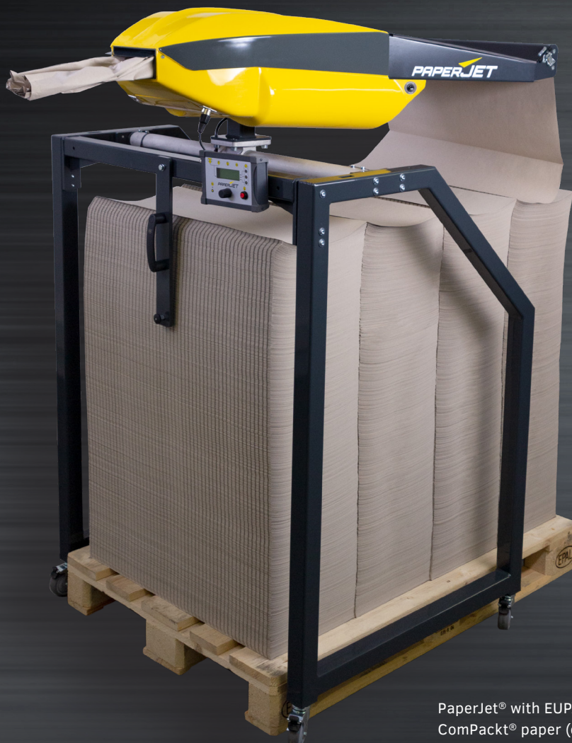
PaperJet® with EUPAL frame and ComPackt® paper (endless)