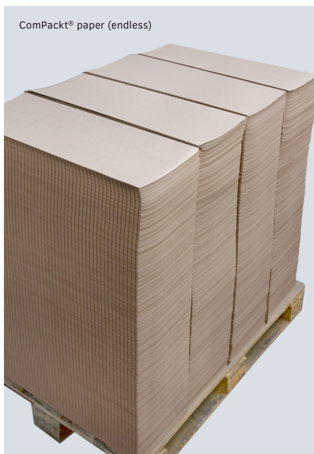
ComPackt® paper (endless)